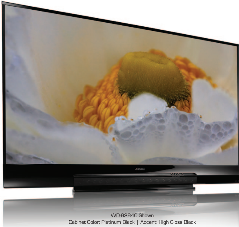
WD-82840 Shown Cabinet Color: Platinum Black | Accent: High Gloss Black